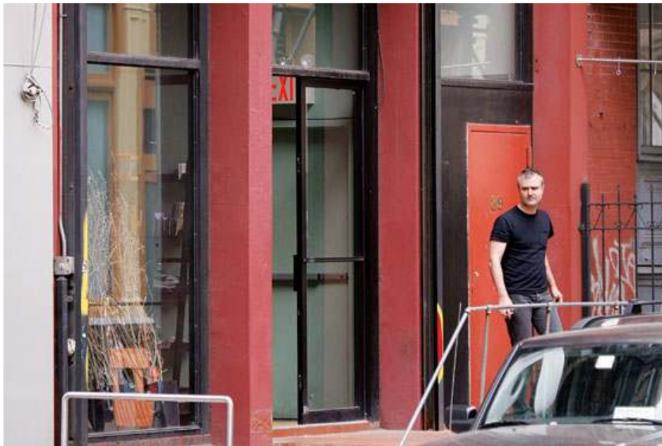
Nick Denton "I'm just the guy behind the curtain. The stars of Gawker, and our other sites, are our writers."