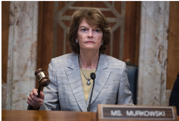
Energy and Natural Resources Chairman Lisa Murkowski, R-Alaska, is no fan of the loan program for energy efficient vehicles.

One way or another, the Energy Department's direct loan program for fuel-efficient car manufacturers looks destined for the chopping block.