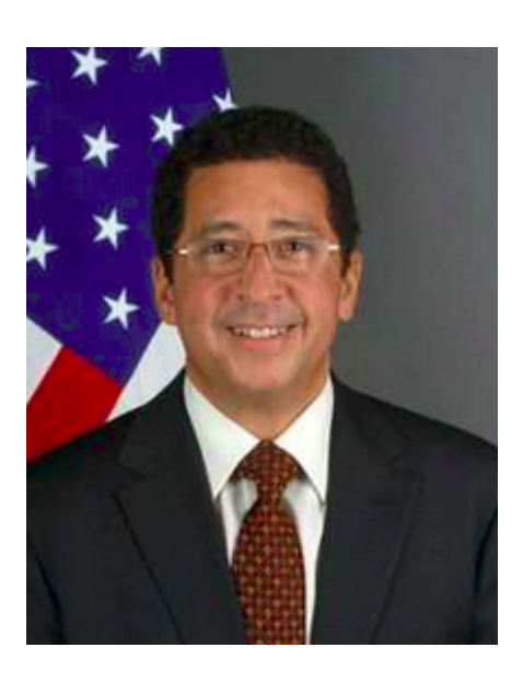
David Goldwyn; Photo Credit: U.S. Department of State

The emails show that, on at least one instance, Goldwyn also used his private "dgoldwyn@goldwyn.org" (Goldwyn Global Strategies) email address for State Department business.