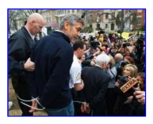
Bombshell: Famously handsome man arrested at political rally