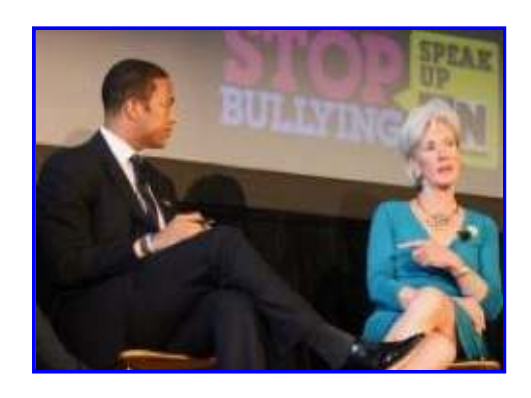
Sebelius to kids: Instead of calling each other "jerks," why don't you call each other "jerks"?