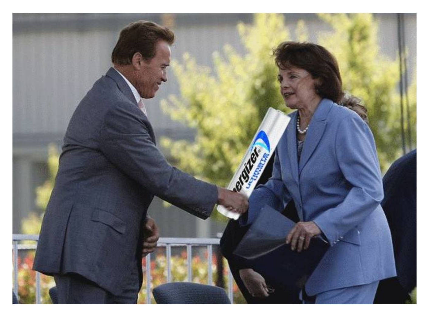
Feinstein used lithium batteries for her personal stock portfolio and screwed over 40 California companies for her profits