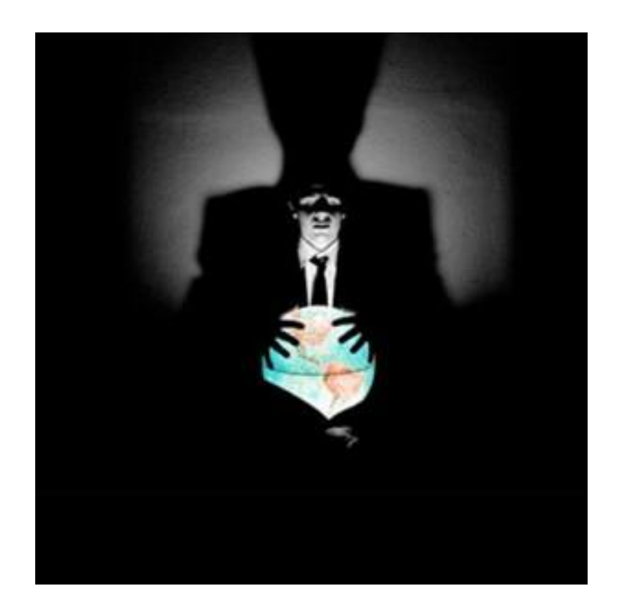
The Feinstein Family