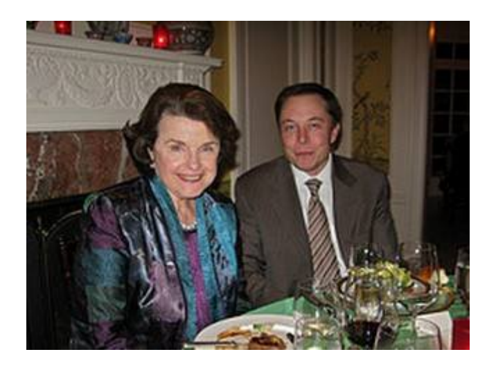
Feinstein & Musk Plot Crony Payola