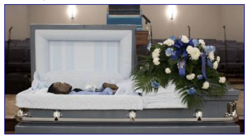
By Philippe Reines

SAN FRANCISCO — Sen. Dianne Feinstein has dominated California politics for more than a quarter of a century. But facing blistering criticism that she's out of touch with the progressive left following her recent comments about President Donald Trump and DACA, it's increasingly looking like the Democratic lawmaker will face a major primary challenge if she runs for a fifth full term.