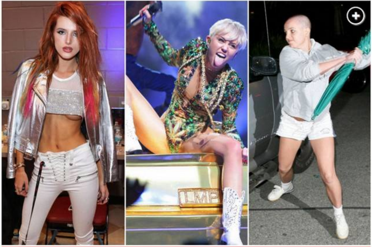
Bella Thorne, Miley Cyrus in 2014 and Britney Spears in 2007.