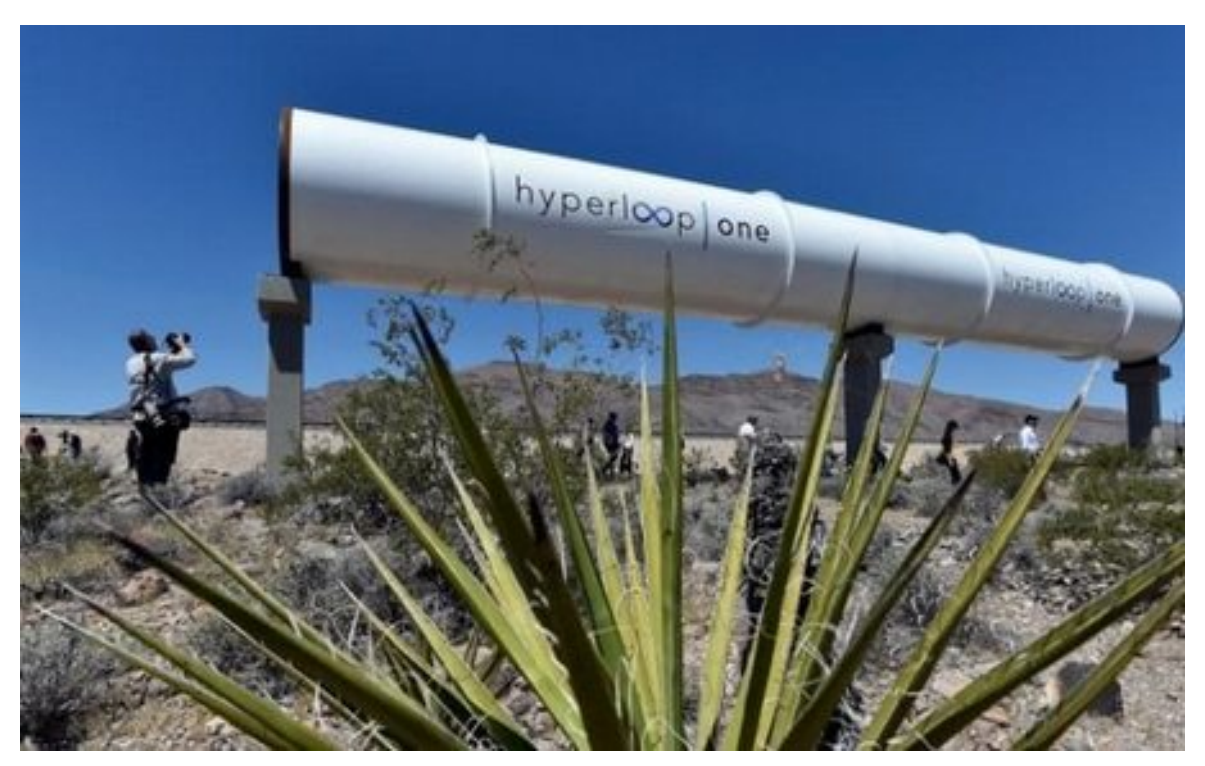
Hyperloop tubes The company said the latest photos showed they are "well-positioned to deliver the first working Hyperloop", the brainchild of US billionaire Elon Musk.