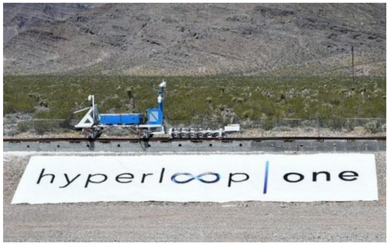
The future of travel?

Hyperloop One hope to perform a public trial later this year, with the aim of creating "a faster, more efficient and cleaner system of mobility" featuring Hyperloop pods travelling at 800 miles per hour.