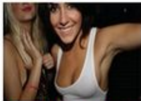
GOOGLE BANNED THIS VIDEO! This Shocking Video Went Viral In Days