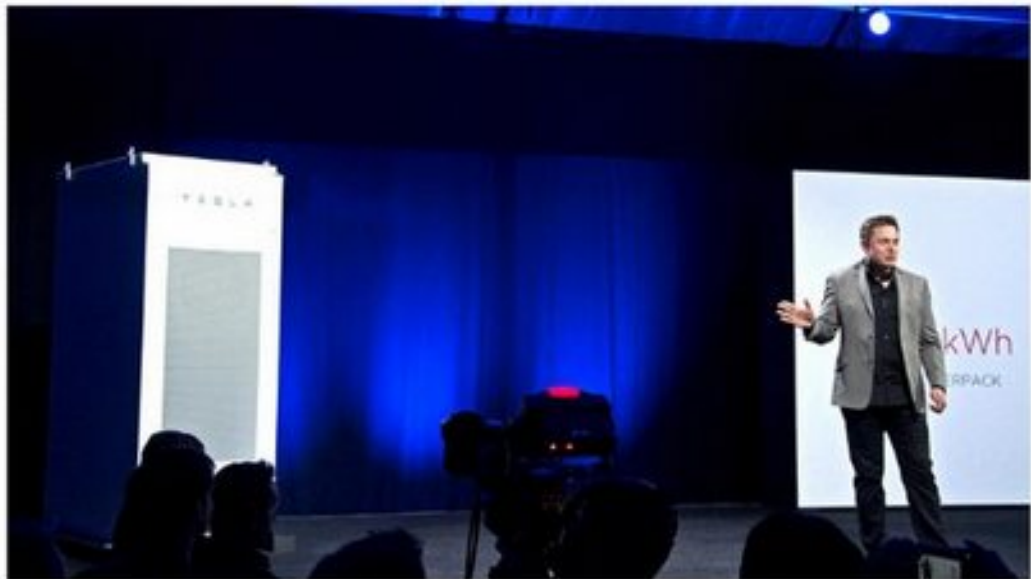
During an event at Tesla's design studio in Hawthorne, Elon Musk introduces a line of batteries for homes and businesses.