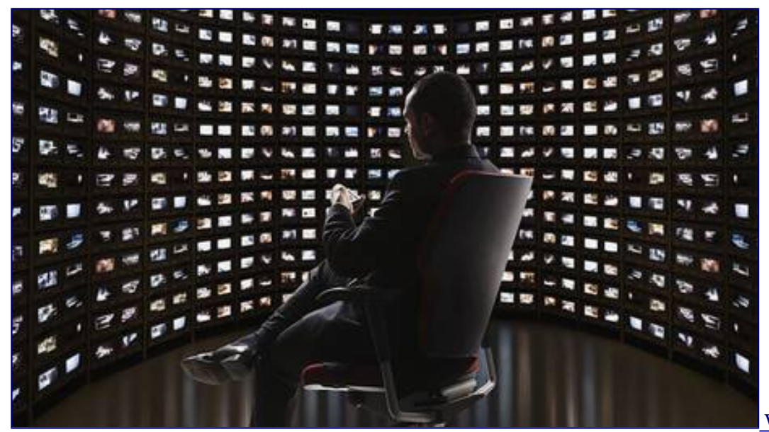
Welcome to 1984: