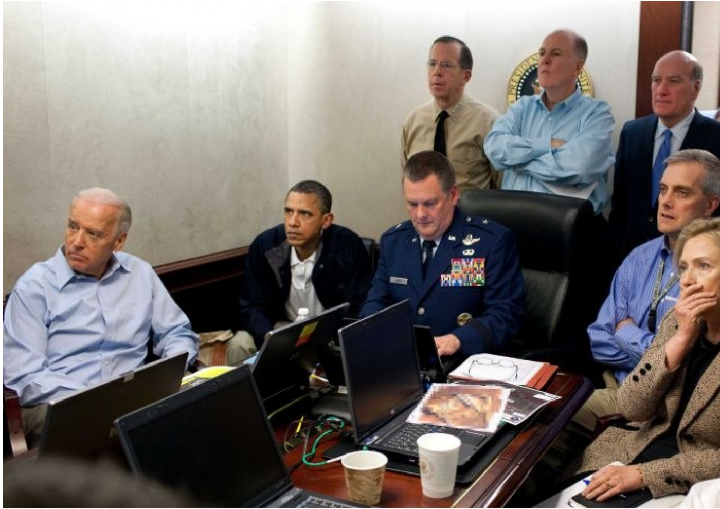
May 1: Secretary of State Hillary Rodham Clinton, President Barack Obama and Vice President Joe Biden, along with with members of the national security team, receive an update on the mission against Usama bin Laden in the Situation Room of the White House.

The Gawker website is under fire for trying to expose the CIA agent who may have helped lead the effort to kill Usama Bin Laden — despite efforts by the U.S. government and media to keep his identity secret for security reasons.