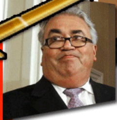
Senator Calderon: ARRESTED: