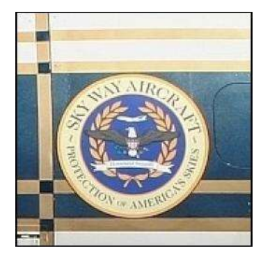
*** # # # ***

During 2003 and 2004, both DC9's controlled by the firm (N-numbers N900SA & N120NE) boasted an official-looking Seal beside the door bearing the familiar image of an American eagle clutching olive branches and arrows in its talons, around which were emblazoned the words "SKYWAY AIRCRAFT, PROTECTION OF AMERICA'S SKIES."