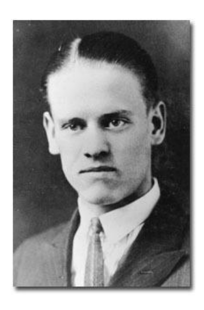
<u>Utah State History</u> And he had a HUGE forehead.

Among those patents was the one that made television possible: an "image dissector" that could capture images as a series of lines to be displayed electronically. If that isn't impressive enough for you, consider the fact that Farnsworth came up with the idea <u>at age 14</u>, while growing up on a farm in Idaho, and first demonstrated it at 21, in 1927. If that didn't make you feel bad about yourself, it should have.