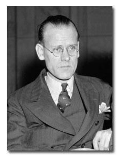
And yet he looks so healthy.

Sarnoff kept Farnsworth tied in a series of legal battles over the next decade using a number of bullshit tactics, like <a href="https://example.com/him">https://example.com/him</a> or using said inventor's earlier patents (which they could never get to work) to argue that he had invented TV. At one point Sarnoff just said "Fuck it" and started making TVs without paying Farnsworth. RCA was eventually forced to pay him a one-time $1 million licensing fee, but it wasn't worth the emotional stress that had left the man crippled.