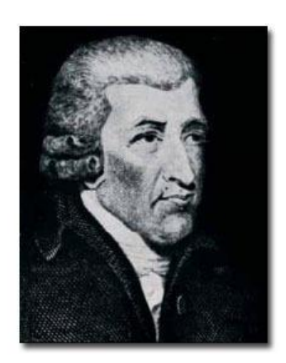
And clearly, eyebrows were very important to this man.

This changed when John Walker, an English chemist born in 1871, began coating sticks in a number of dangerous-sounding chemicals until he happened upon one that, when struck against a surface, erupted in flames. Other selfigniting matches had been tried before, but they were extremely impractical, by which we mean that a lot of people probably lost their eyebrows or worse using them.