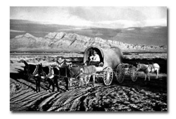
Then "she" came around the mountain and snatched up all his royalties.

Actually, all those songs and more were written by the same person, and he did try to cash in on them -- the keyword being "try."