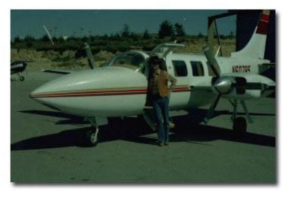
DigiBarn Computer Museum

Let he who hasn't blown off a corporate giant to go flying cast the first stone.