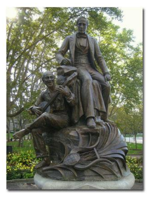
Some of which were melted down to make this statue.

His contributions can't be overstated. Not only did he create most of the conventions of popular songwriting as we know them today, but he also demonstrated the need for intellectual property laws by getting repeatedly screwed.