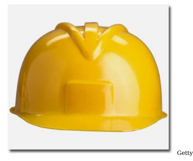
Today's lesson is, if you're an inventor, wear a freaking helmet.