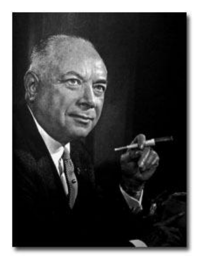
Pay respect to his memory by printing out this picture and drawing a dick on it today.

It took decades for FM radio to recover. In the late '70s, it finally surpassed AM, but Armstrong was long gone by then, having committed suicide in 1954 by jumping from the 13th floor of his office building, presumably screaming "FUCK SARNOOOOOFFFF" all the way down.