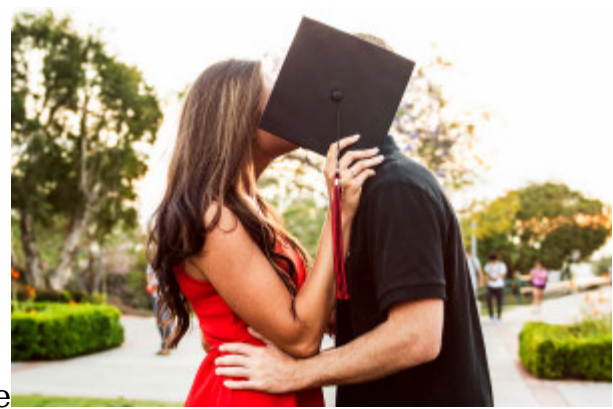
Enlarge Image

Unlike the actual final dance of official senior week (the much more formal Senior Soiree), the Last Chance Dance takes place at a club off campus, and is much more casual and free-spirited. Matches are always released before the dance. And while last-ditch hookups aren't the point of the event, the two often go hand in hand.