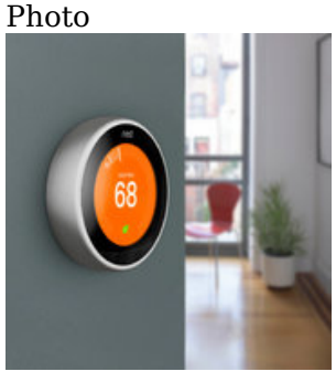
A Nest thermostat.

The scope of his curiosity was apparent at Sci Foo Camp, an annual invitation-only conference that is sponsored by Google, O'Reilly Media and Digital Science.