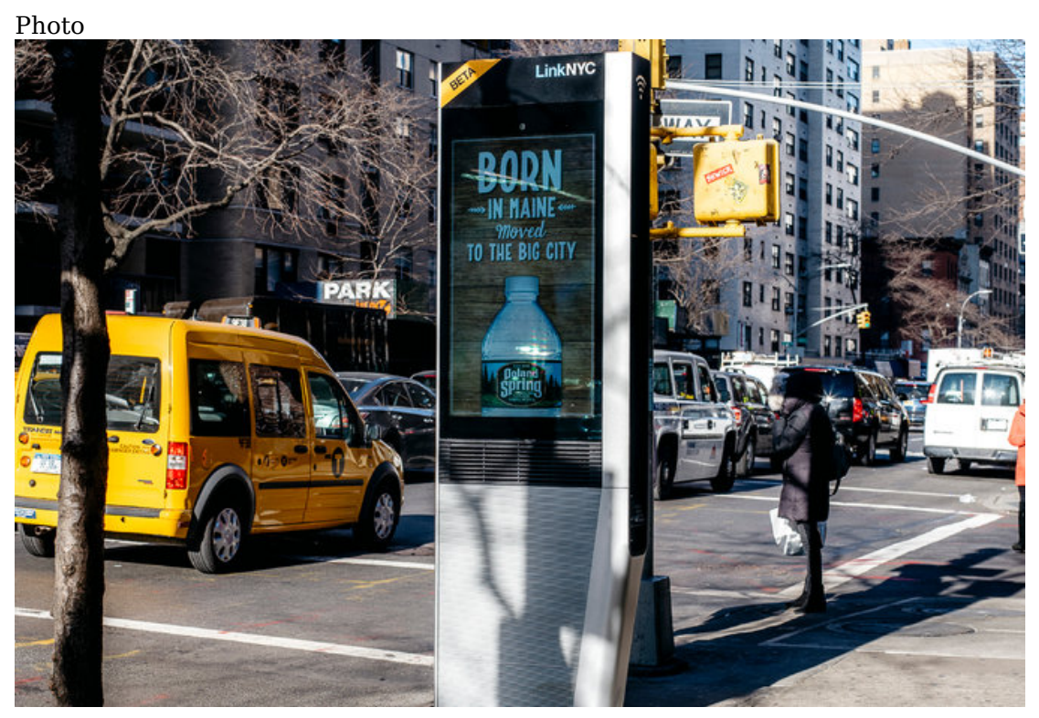
LinkNYC Wi-Fi consoles, a product of Sidewalk Labs, a company owned by Google.

"I ask them, like, 'How does the transformer work?' 'How does the power come in?' 'What do we pay for that?'" he said. "And I'm thinking about it kind of both as an entrepreneur and as a business person. And I'm thinking 'What are those opportunities?'"