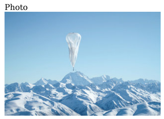
A Project Loon balloon.

One attendee, who asked to remain anonymous because guests were not supposed to discuss the gathering, recalls being surprised by how much time Mr. Page spent with his children.