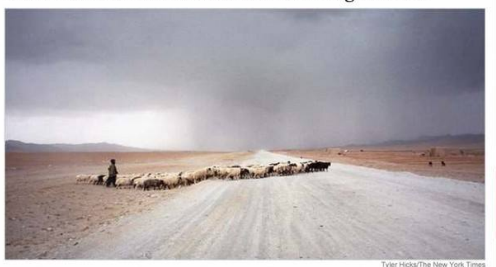
A bleak Ghazni Province seems to offer little, but a Pentagon study says it may have among the world's largest deposits of lithium.