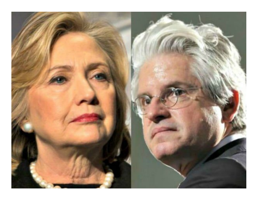
"Why correct the record, David, when you can just delete it?"