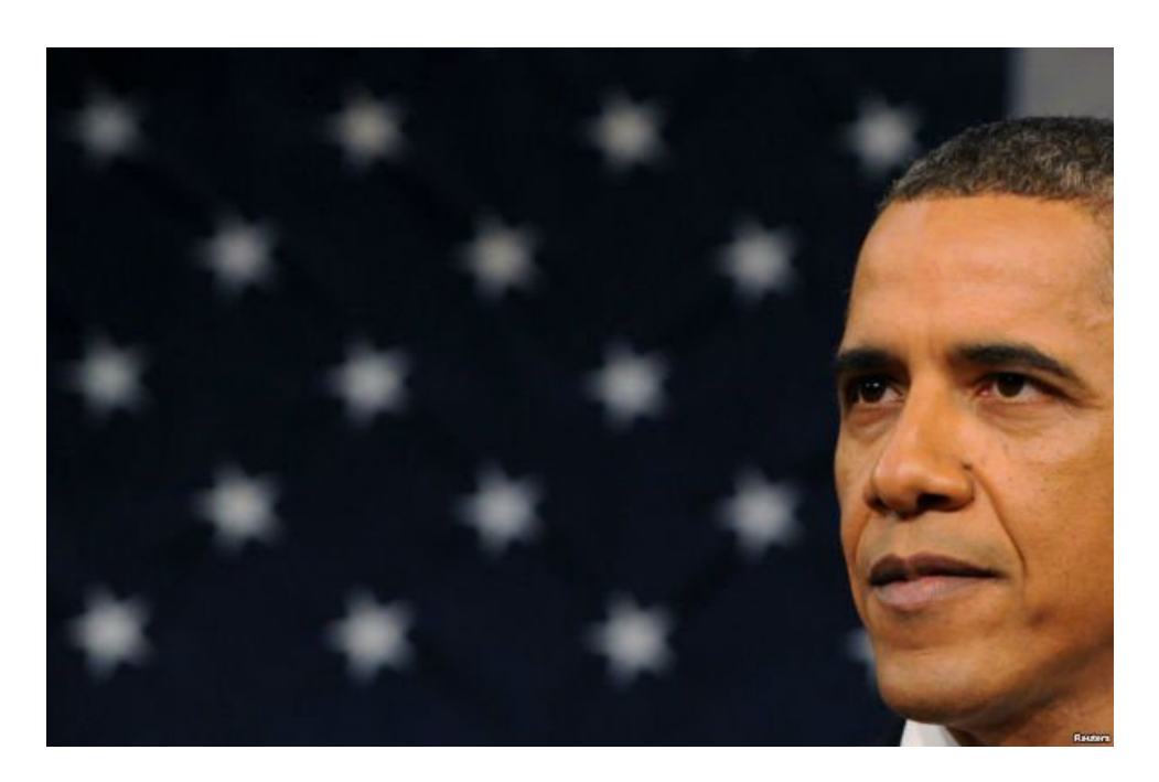
Big Brother Hussein Is Watching You

Posted by Elliot Bougis | Oct 15, 2016 | Top Article