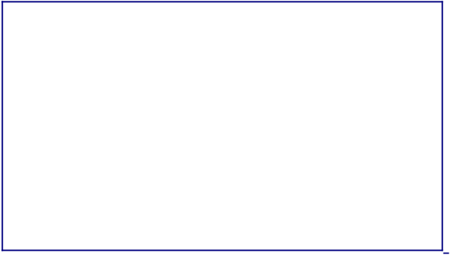
Slack is resetting thousands of passwords after 2015 hack

Data breaches used to be spearheaded by highly skilled hackers. But it increasingly doesn't take a sophisticated and carefully planned operation to break into IT systems. Hacking tools and malware that are available on the dark web make it possible for amateur hackers to cause enormous damage. A <u>strict</u> <u>data protection law</u> that came into effect last year across the European Union has placed new burdens on anyone who collects and stores personal data. It also introduced hefty fines for anyone who mismanages data, potentially opening the door for the Bulgarian government to fine itself for the breach.