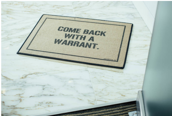
A doormat inside the Intercept's D.C. offices reads "Come Back With a Warrant."