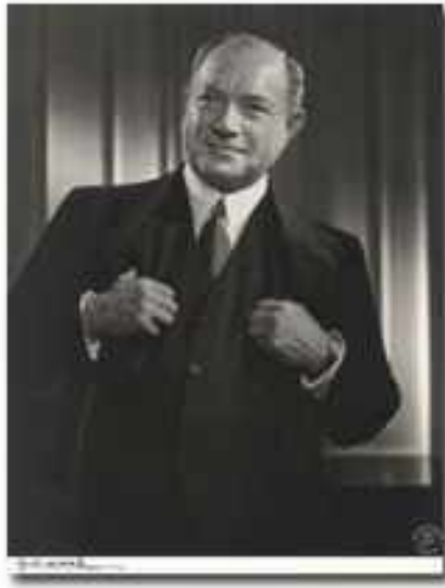
The David Sarnoff Library