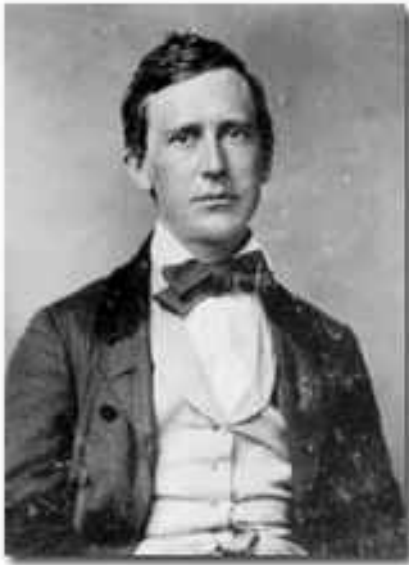
Not many pop stars can pull off a bow tie.

Of course, the problem with being the first in his profession was that there were no such things as "enforcing copyright" or "not screwing over songwriters" back then. Today, Foster would have earned obscene amounts of money from "Oh! Susanna" alone, but in 1848, he got exactly $100 for the rights to publish the sheet music, while the publisher made $10,000 selling his work.