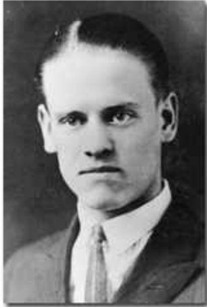
Utah State History