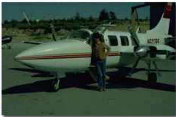
DigiBarn Computer Museum

In 1980, IBM was getting ready to launch its first personal computer and needed an operating system to operate the shit out of it. They first knocked on Microsoft's door, but Microsoft wasn't really into the OS-making business at that point, so they directed the IBM suits to Gary Kildall's company. However, as nerd lore has it , Gary picked that day to go flying (he was an amateur pilot), blowing off IBM and his chance at history.