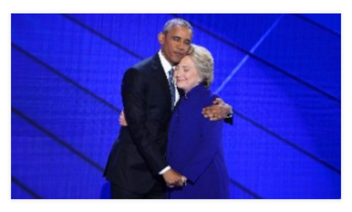
A very special moment during Democratic National Convention 2016