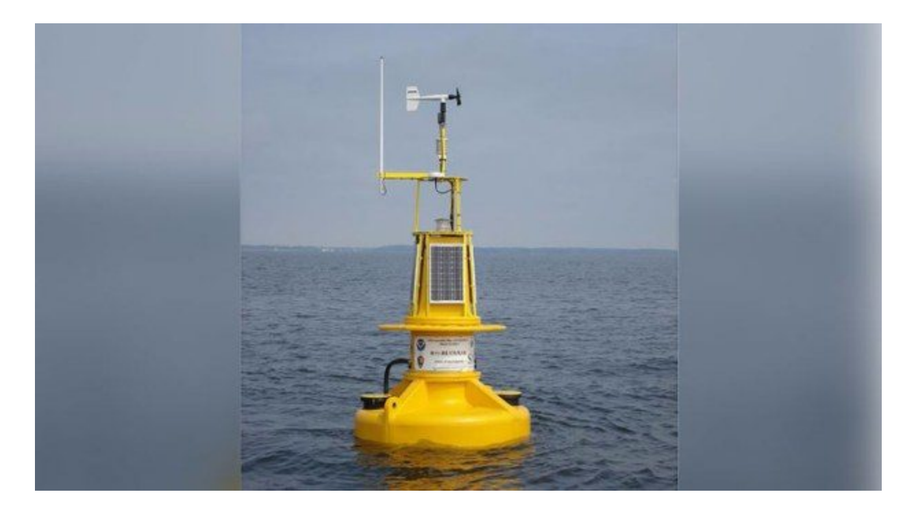
"They had good data from buoys. And they threw it out and 'corrected' it by using the bad data from ships. You never change good data to agree with bad, but that's what they did – so as to make it look as if the sea was warmer," said the scientist.