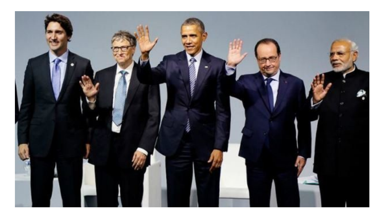
Canadian Prime Minister Justin Trudeau, Microsoft co-founder Bill Gates, Former US President Barack Obama, French President Francois Hollande and Indian Prime Minister Narendra Modi at the Paris Climate Conference in 2015.

After rising by 0.113C per decade between 1950 and 1999, temperatures appeared to have stabilized between 2000 and 2014, despite rising levels of CO2 emissions, which climate change scientists said were responsible for the earlier warming.