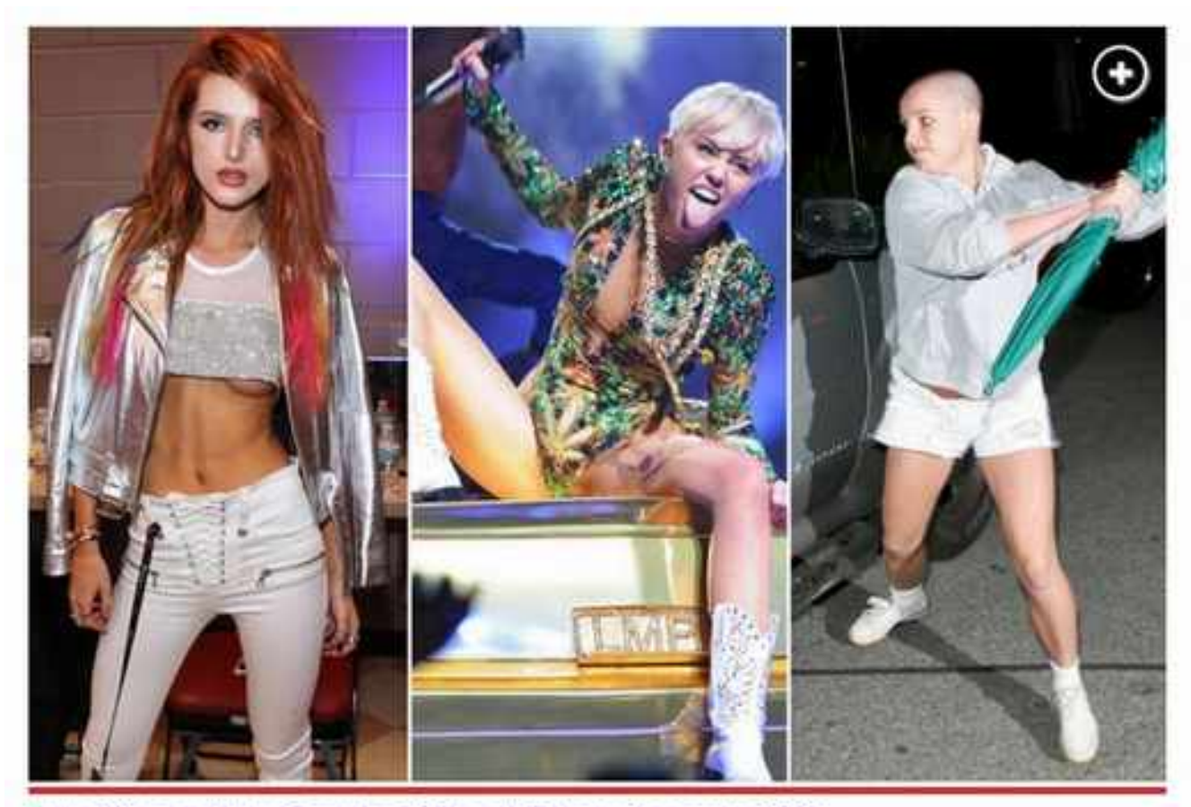
Bella Thorne, Miley Cyrus in 2014 and Britney Spears in 2007.

Bella Thorne, Miley Cyrus in 2014 and Britney Spears in 2007.